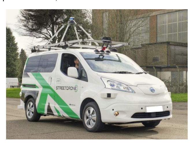
Figure 4 - Osney Mead Demonstration Route

The vehicle is fully compliant with MOT, insurance and Construction and Use Regulations.